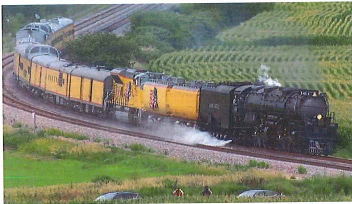
Big Boy No. 4014 hauls cars in Union Pacific's classic and distinctive "Armour Yellow" livery through Woodbine, Iowa on its 2024 "Heartland of America" tour.